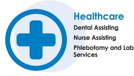
Healthcare Dental Assisting Nurse Assisting